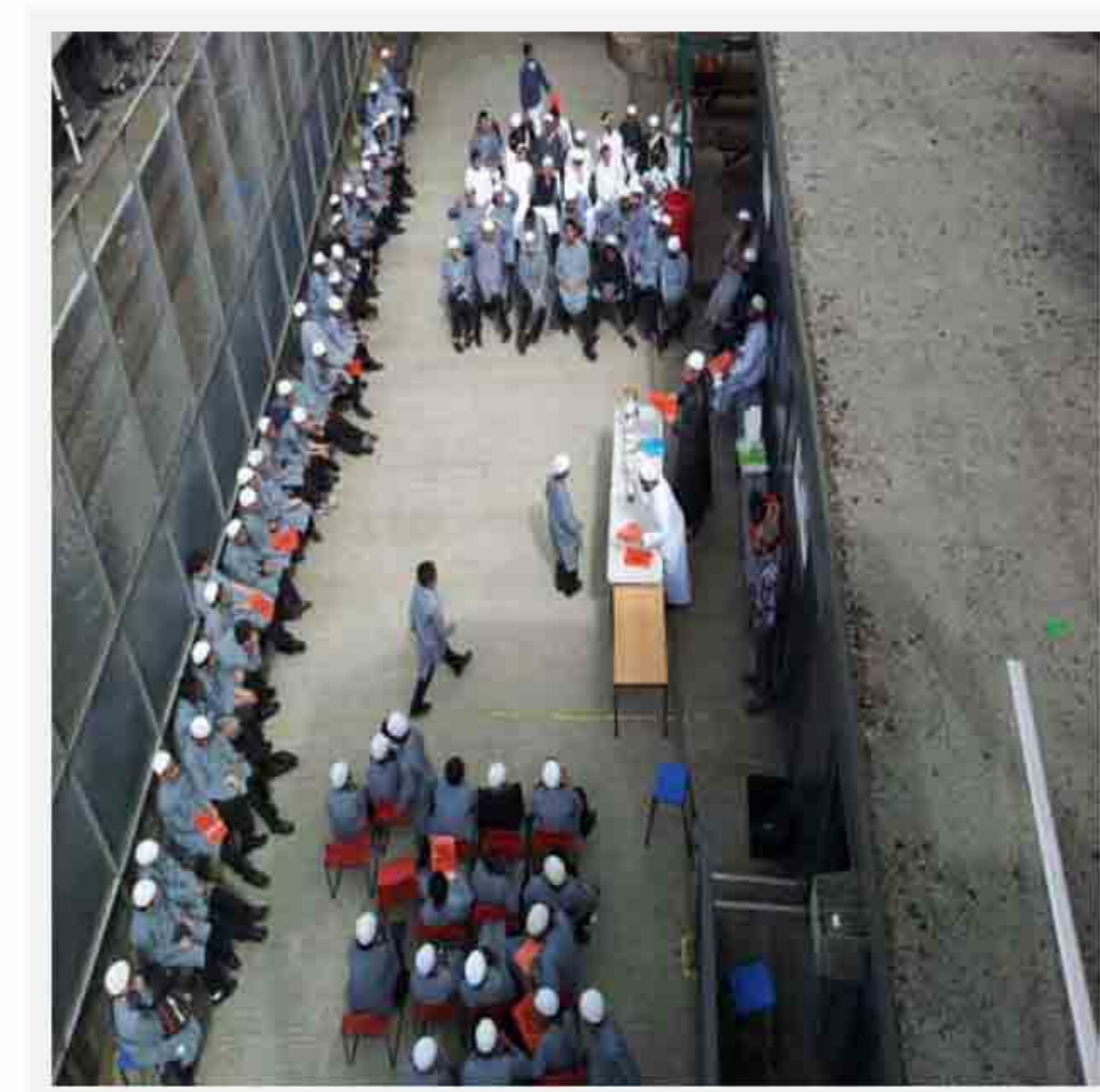
Students collect their awards during the school presentation ceremony in July.