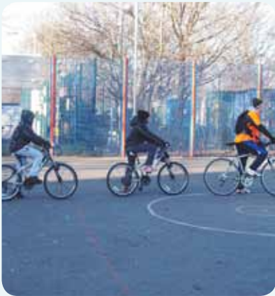
Students Riding Pool Bikes at Kingsmead Primary School