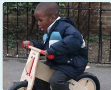
LIKE-A-BIKES at St Mary's CE Primary School

If you do not have a copy of the application form it can be downloaded at www.hackney.gov.uk/stp . This round of funding will close Friday 1 October 2010. Don't miss out!