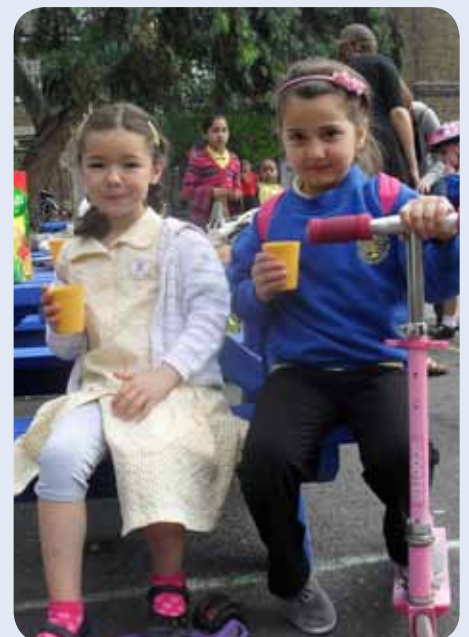
Dr Bike and Bikers' Breakfast at London Fields Primary School